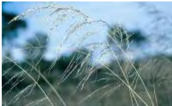
Figure 3. African lovegrass seed head.

African lovegrass prefers low fertility acidic or sandy soil types.