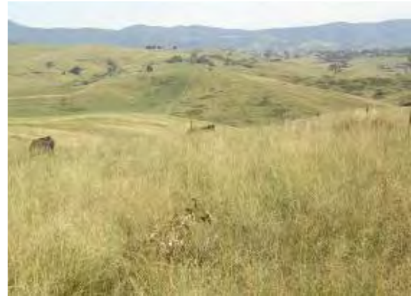
Figure 2. African lovegrass on the coast. (L. Pope)

African lovegrass is a native of southern Africa. It can also be found in Argentina and the United States where it is used as a forage plant. It was thought to have been accidentally introduced into Australia prior to 1900 and has since been deliberately introduced for experimental assessment.