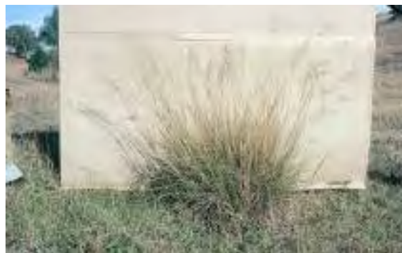
Figure 4. African lovegrass plant. (M. Campbell)

Consol lovegrass has been selected from African lovegrass for sowing as a pasture plant, and is known as Eragrostis curvula cv. Consol. It does not have the weedy characteristics of other agronomic types of African lovegrass. It is sown on light sandy soils on the slopes and plains of NSW. However Consol lovegrass is not permitted to be grown in local government areas where African lovegrass is