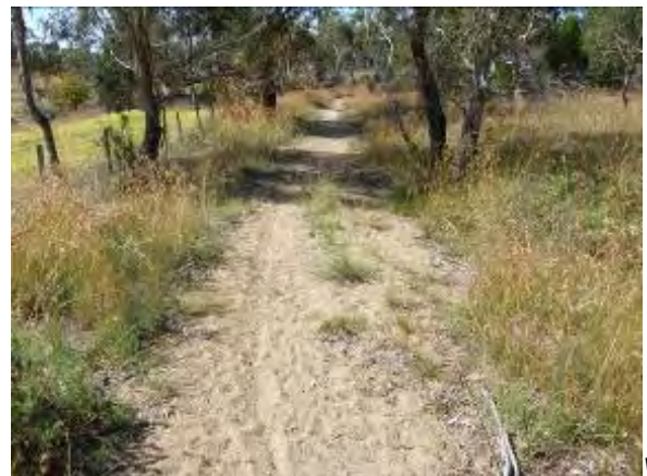
Figure 7. Lovegrass will often be found along farm tracks

Weed seeds are easily transported in hay and fodder purchases. If purchasing hay from a known African lovegrass area then check it for any obvious signs of weed seed contamination. Supplementary feeding in a smaller 'sacrifice' paddock is also a good idea to minimise weed seed spread.