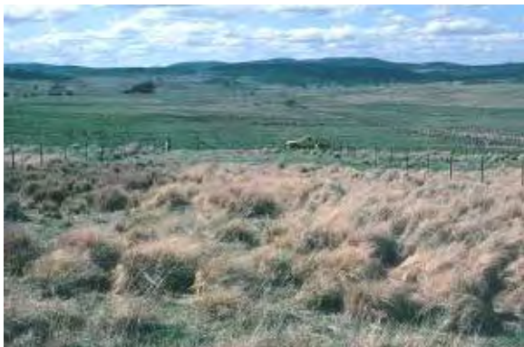
Figure 1. A heavy African lovegrass infestation.

African lovegrass ( Eragrostis curvula ) is a hardy, drought tolerant perennial grass species which thrives on sandy soils with low fertility. In some countries it is regarded as valuable for animal production and soil conservation but in others, such as Australia, it is regarded as a weed due to its low feed quality and acceptance by livestock. In Australia, seven agronomic types of African lovegrass are recognised. Its weed status depends on the environment in which it grows, the agronomic type and the land management being practised.