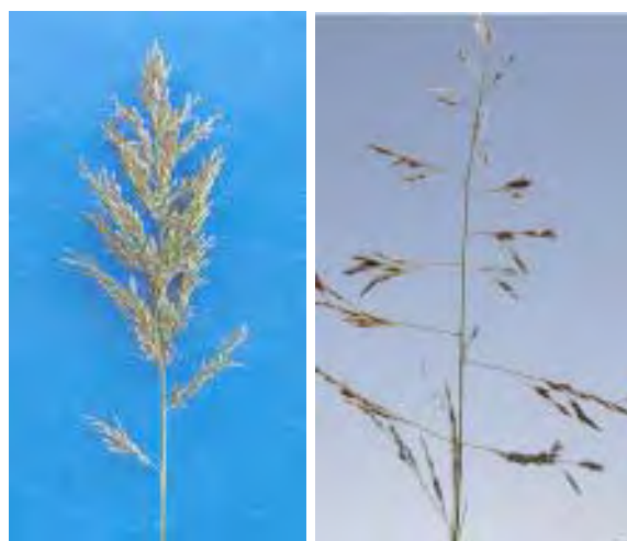
Figure 5. Consol lovegrass (left) and African lovegrass (right). (L. Pope)

declared noxious. For more information on Consol lovegrass see Primefact 121 (2006) Consol lovegrass .