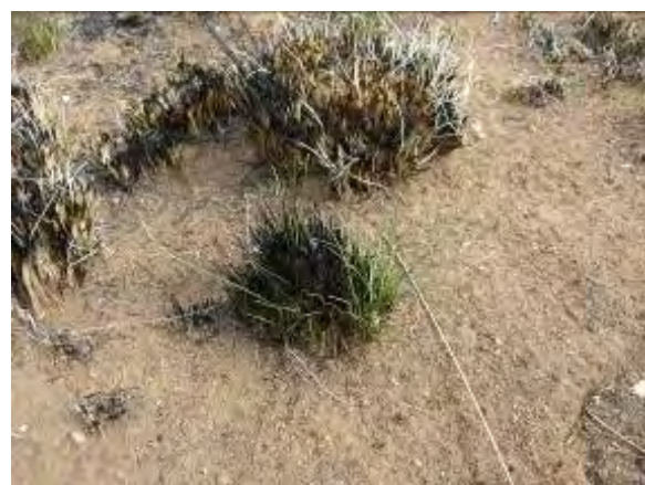
Figure 8. African lovegrass recovery following fire. (D. Alcock)

If direct drilling, aim to remove plant material by heavy grazing. Where a large bulk of material is present, burning may be necessary before spraying. A glyphosate-based herbicide can then be used to kill any re-growth once sufficient green leaf and active growth is occurring. This should occur in the spring prior to a planned sowing in autumn. A repeat application of glyphosate or other suitable herbicide may be necessary on the autumn break prior to sowing to kill any other weeds and new seedlings.