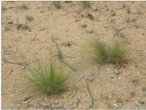
Figure 6. African lovegrass readily invades bare ground. (L. Pope)