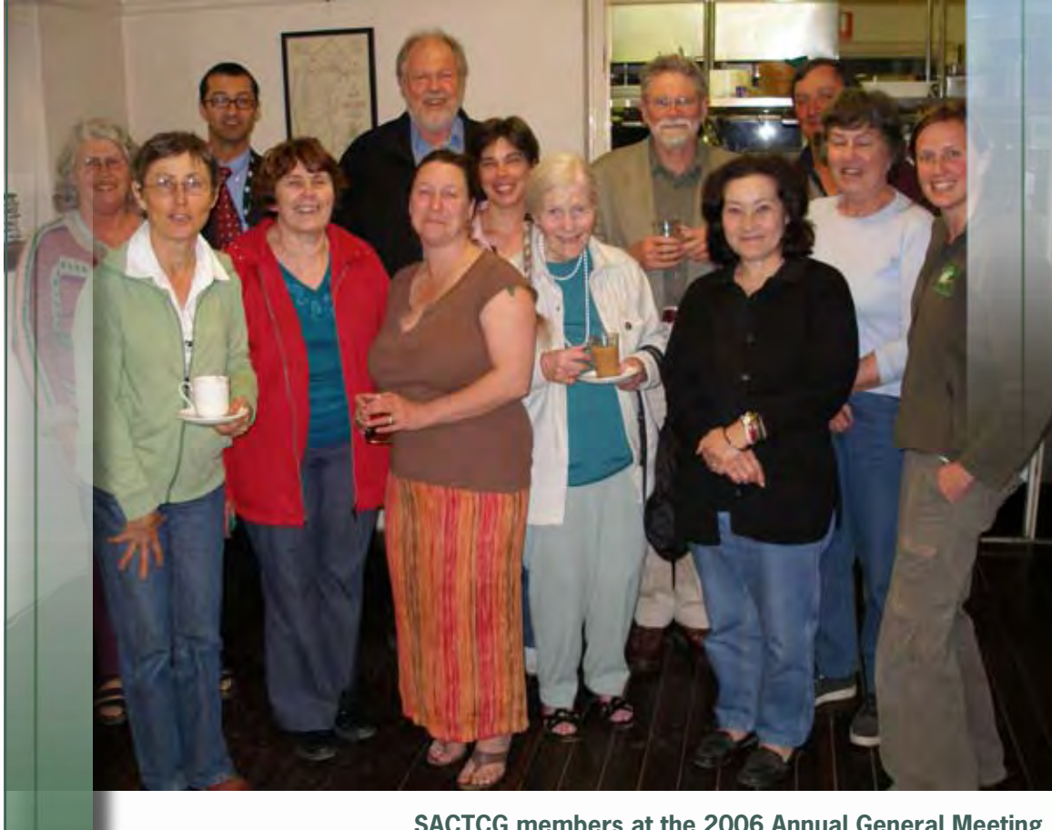
SACTCG members at the 2006 Annual General Meeting

The catchment group continues to play an important role in supporting new initiatives, disseminating funds, coordinating community monitoring efforts, monitoring and evaluating projects, collecting data, reporting, sharing information, capacity building and community education. Our vision for the future is to continue as an independent community organisation, raising awareness of environmental issues within our catchment and actively participating in sustainable natural resource management.