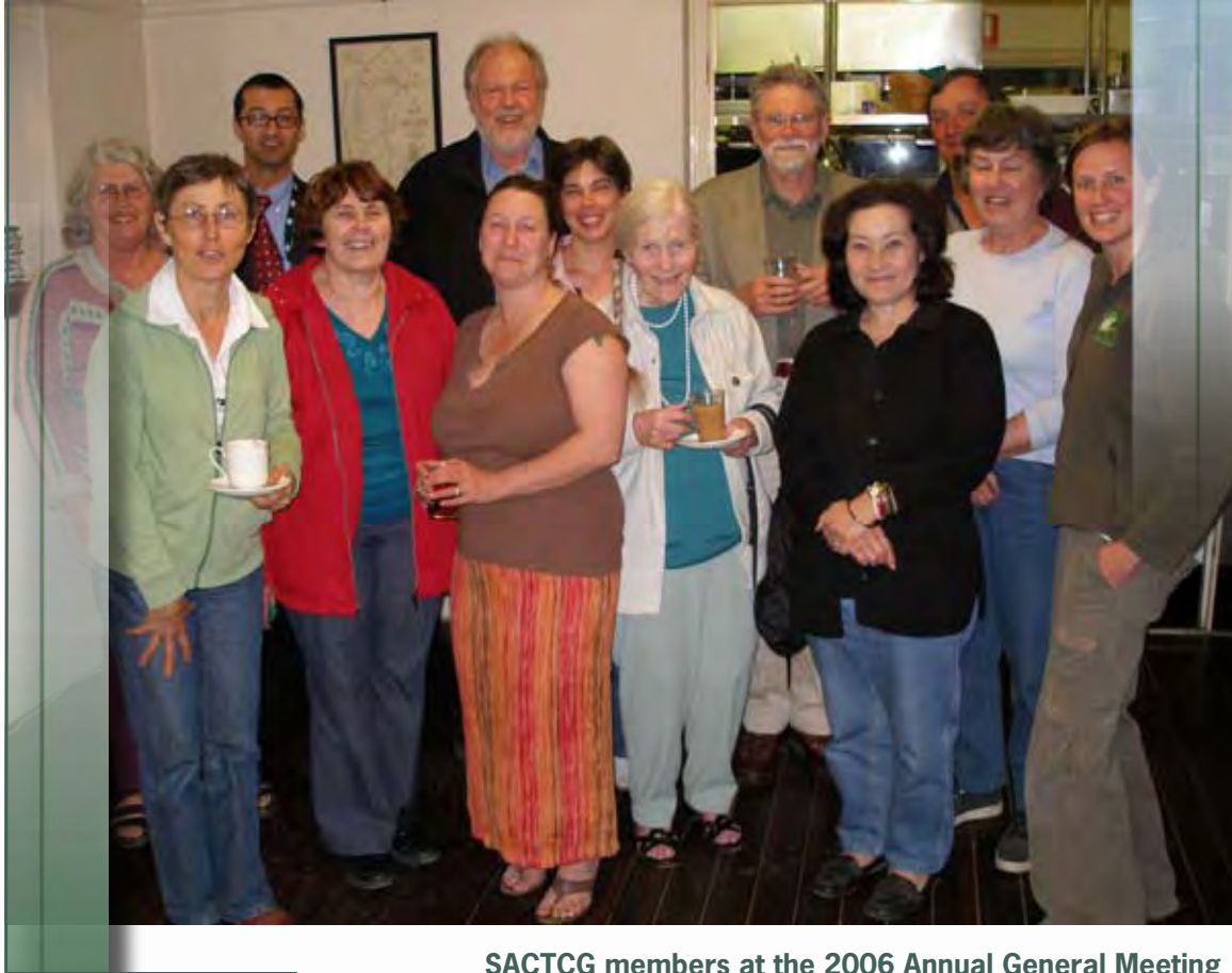
SACTCG members at the 2006 Annual General Meeting

The catchment group continues to play an important role in supporting new initiatives, disseminating funds, coordinating community monitoring efforts, monitoring and evaluating projects, collecting data, reporting, sharing information, capacity building and community education. Our vision for the future is to continue as an independent community organisation, raising awareness of environmental issues within our catchment and actively participating in sustainable natural resource management.