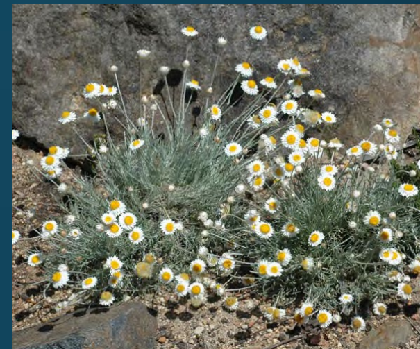
Leucochrysum albicans Hoary Sunray