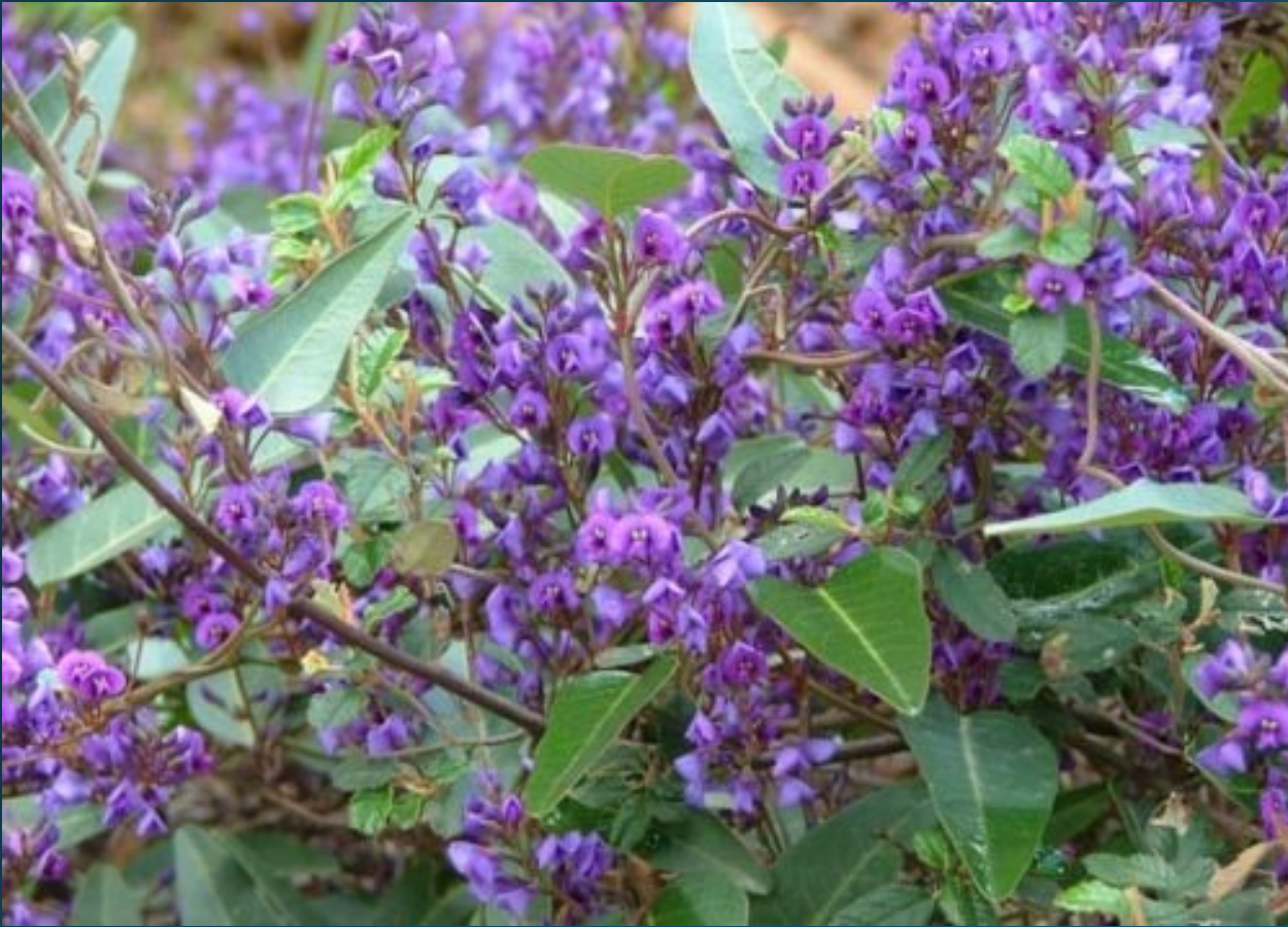
False Sarsparilla Hardenbergia violacea