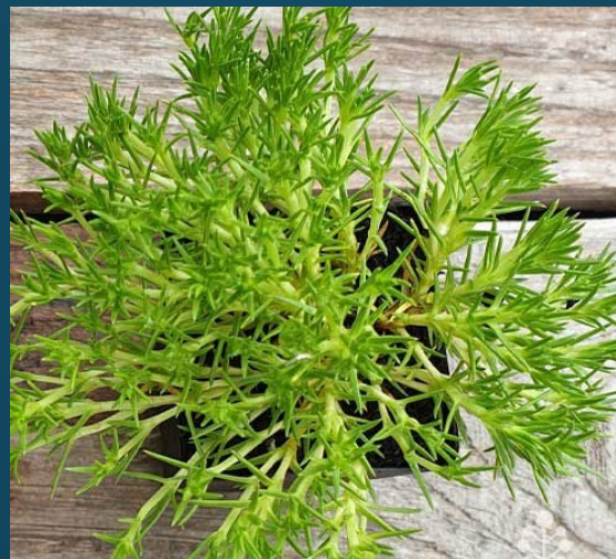
Scleranthus biflorus Cushion Bush