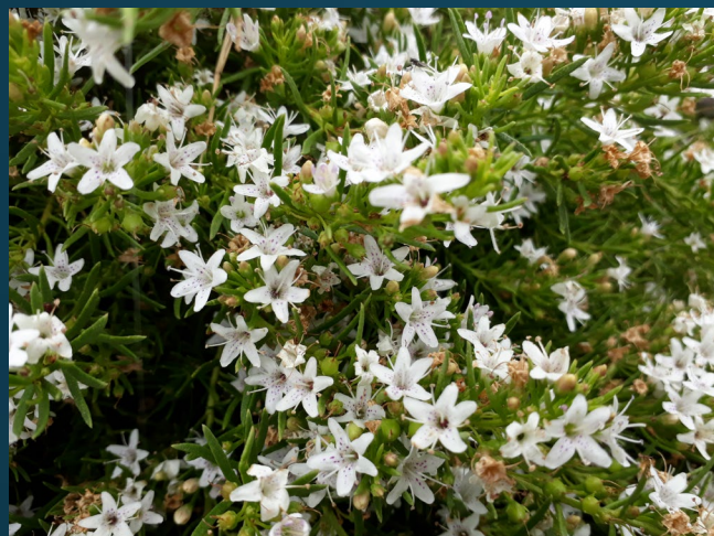
Myoporum parvifolium Creeping Boobiella