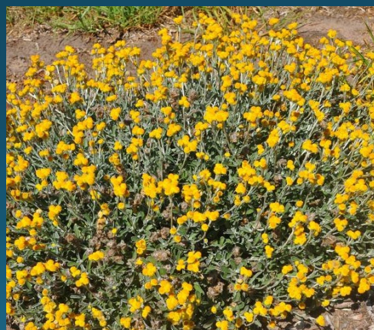
Chrysocephalum apiculatum Common Everlasting